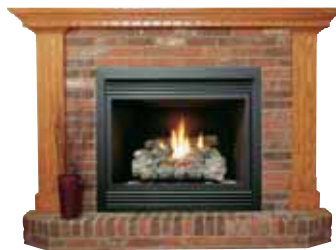
ZDV5245N Fireplace, Z52GBL Black Grills, LOGF30 Fibre Split Oak Log Set

Enjoy the elegance and warmth of glowing embers and dancing flames around our fibre split oak log set. It is sure to be the focal point of your home.