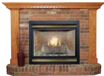
ZDV5245N Fireplace, Z52GBP Classic Builder Grill, LOGF24 Fibre Oak Log Set, and Z52RL Refractory Liner